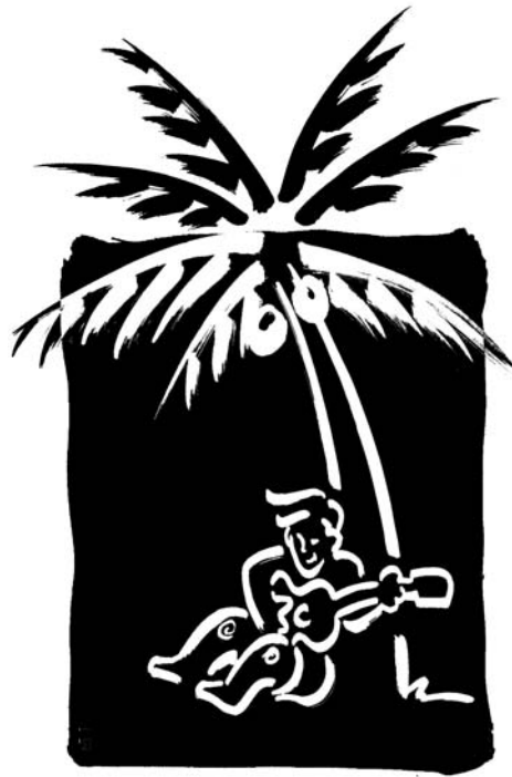
songs from the middle of the ocean